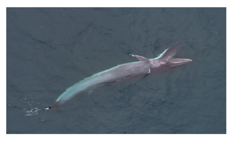
Fig. 1. Lateral lunge feeding of a fin whale (Whale-A) with its right jaw down. A detailed behavior sequence and the shape of prey patches are shown in the supplement video.