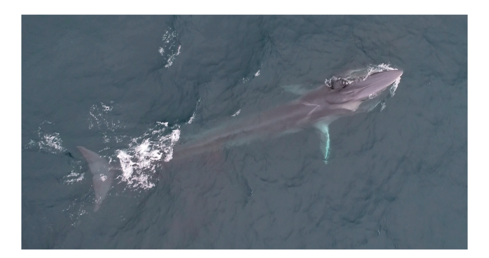
Fig. 2. Lunge feeding of Whale-A without turning the body sideways.

the sea surface around the whales. Both whales A and B were feeding on the sea surface and no deep diving was observed. The swimming direction of Whale-B was not constant, and the feeding was made in circular movements. When the patch formed longitudinally on the sea surface, the whales were either lunging parallel to it or passing through when they were intersecting perpendicular to the patch. The change in the direction of lunging relative to the patch could be for increasing prey capture efficiency. More detailed observation of the feeding behavior indicated the whales were lunging laterally with their right jaw down (Fig. 1). A total of four blows and six lateral lunge feedings were observed in Whale-A during a period of 225 seconds for a distance of about 620 m (distance calculated from the UAV flight log). Most of the time, lunge feeding was carried out laterally, however, non-lateral lunge feeding was observed twice on Whale-A (Fig. 2). Whale-B made lateral lunge feedings three times and blew twice during a period of 143 seconds for a distance of approximately 280 m with no display of non-lateral lunge feeding.